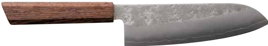
GS-03 Santoku Knife 167mm ■ Sugg. price USD210 JAN code: 4971884165313