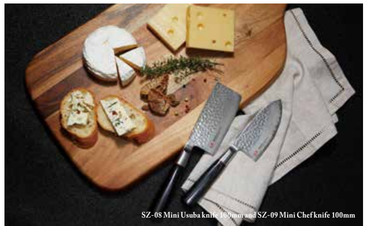
SZ-08 Mini Usuba knife 100mm and SZ-09 Mini Chef knife 100mm