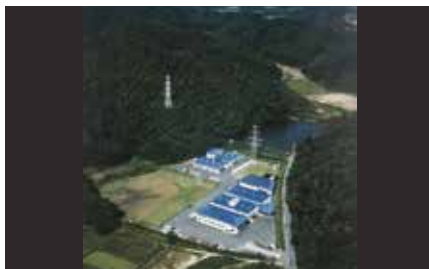
1978年 関市池尻 1924 に移転