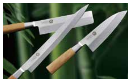
2007年 海外包丁「MU 無」発表 (デザイナー・パロ)