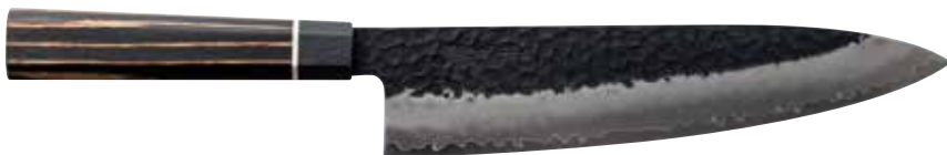
ZB-04 Chef Knife 210mm

■ Sugg. price USD380 JAN code : 4971884164316