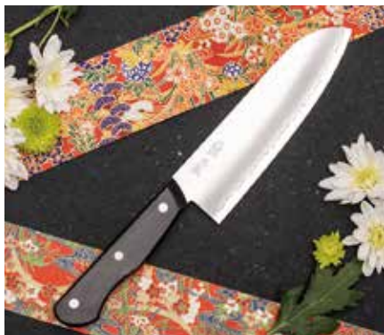
EN-02 Santoku knife 167mm