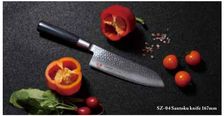
SZ-04 Santoku knife 167mm