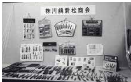
1959年 株式会社川嶋新松商會 設立