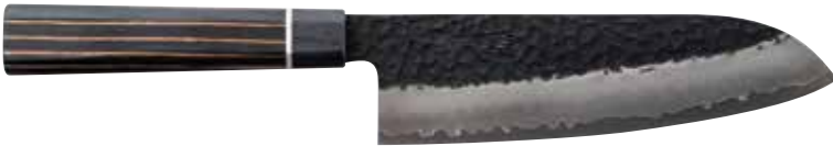
ZB-03 Santoku Knife 170mm

■ Sugg. price USD260 JAN code : 4971884164217