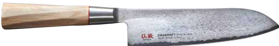
TO-04 Santoku knife 167mm