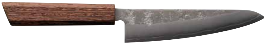
GS-02 Small Santoku Knife 143mm ■ Sugg. price USD170 JAN code: 4971884165214