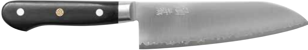
MP-03 SANTOKU KNIFE 165MM ■ Sugg. price USD250 JAN code : 4971884226519