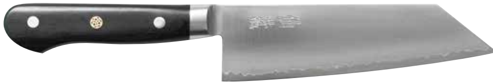
MP-05 BUNKA KNIFE 165MM ■ Sugg. price USD250 JAN code : 4971884226717