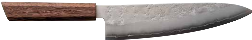
GS-04 Chef Knife 200mm ■ Sugg. price USD220 JAN code: 4971884165412