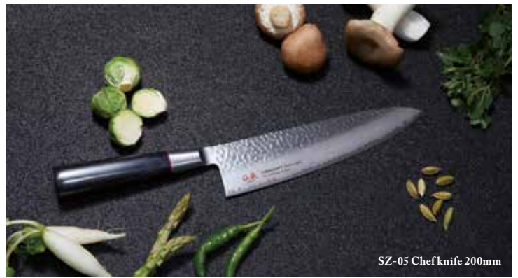
SZ-05 Chef knife 200mm