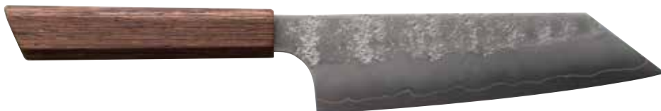
GS-05 Bunka Knife 165mm ■ Sugg. price USD210 JAN code: 4971884165511