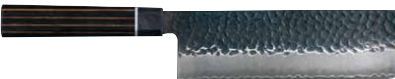
ZB-06 Nakiri knife 170mm

■ Sugg. price USD380 JAN code : 4971884164514