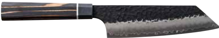
ZB-05 Bunka Knife 165mm

■ Sugg. price USD400 JAN code : 4971884164415