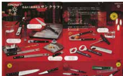
1966年 ナイフ・ガジェット類「SUNCRAFT (サンクラフト)」発表 1969年「SUNCRAFT (サンクラフト)」グッドデザイン賞取得