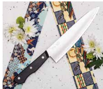
EN-03 Chef knife 200mm