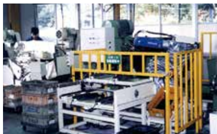
1980年 キッチンツール「メリアンティ」発表