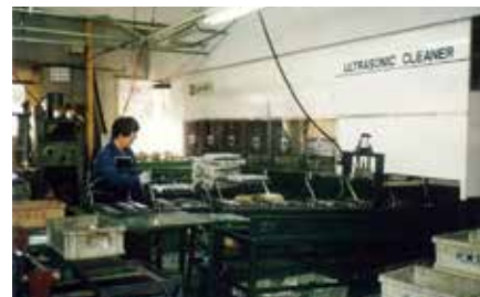
1978年 関市池尻 1924 に移転。さらなる設備投資を行った