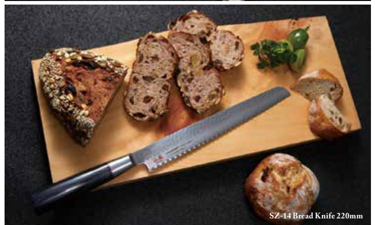
SZ-14 Bread Knife 220mm