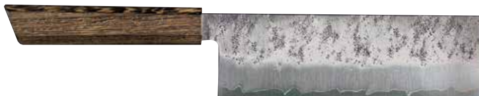
GS-06 Nakiri knife 170mm ■ Sugg. price USD220 JAN code: 4971884165610

Material/ Blade: Blade: 3 layers Clad steel (Gin-san, Silver 3) • Handle: Wenge natural wood handle in octagonal shape. Packaging/ Individual paper gift box (6pcs in inner box)