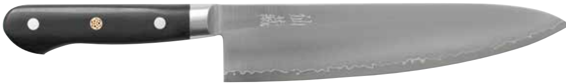
MP-04 CHEF KNIFE 210MM ■ Sugg. price USD290 JAN code : 4971884226618