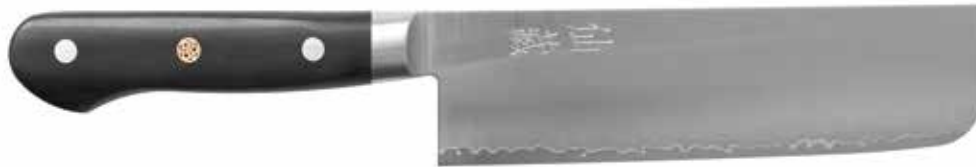
MP-06 NAKIRI KNIFE 165MM ■ Sugg. price USD250 JAN code : 4971884226414