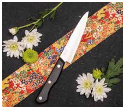
EN-01 Petty knife 120mm

初めて日本製の包丁をお使い頂く方向けに、お求めやすい価格帯でかつ高品質な包丁シリーズになっています。3層鋼のブレードは刃先の薄さを追求し、日本製包丁独特の切れの良さを実感いただけるでしょう。