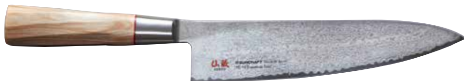
TO-05 Chef knife 200 mm