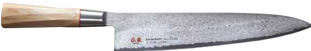
TO-06 Chef knife 240 mm